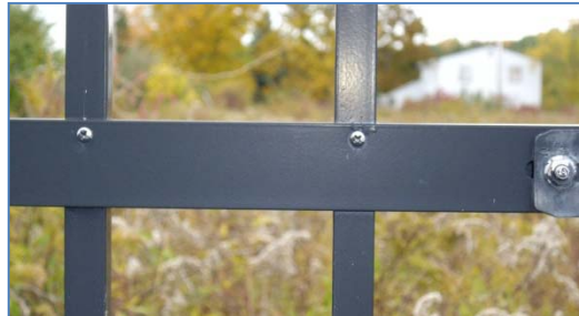
Deterioration of coating on screw heads and brackets.

The design determines how the fence will look and perform. For many years manufacturers have used screws to hold the pickets to the rails. A few things result from this design. First, it creates an unsightly look since you see the screw heads on one side of the fence. Second, the coating on the screws sometimes wears off over time which leaves a silver color screw head visible. Some screws may even pop out because of the expansion and contraction caused by the temperature changes.