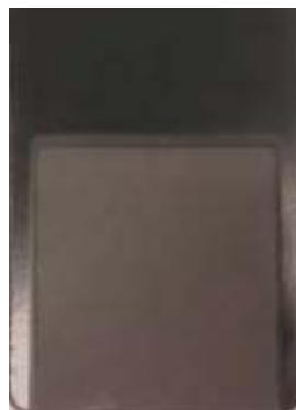
General Purpose Powder Coating