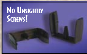
Hidden E-Clip Fasteners Patent #US 7,152,849 B2